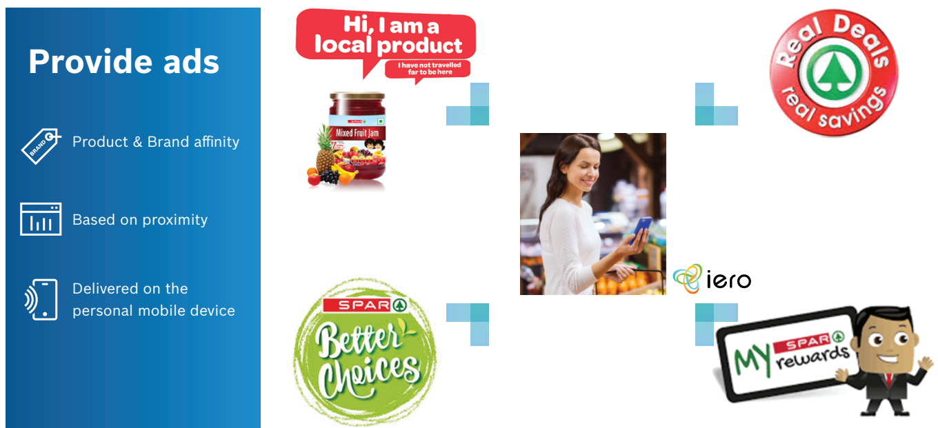
Illustration 1: Targeted Advertising & Personalized Ads

All of this is achieved through IERO’s AI powered personalization engine at the right location (through its outdoor and indoor positioning system) at the right